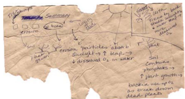
Fig. 4 Diagram of erosion found as a scroll in Taiga