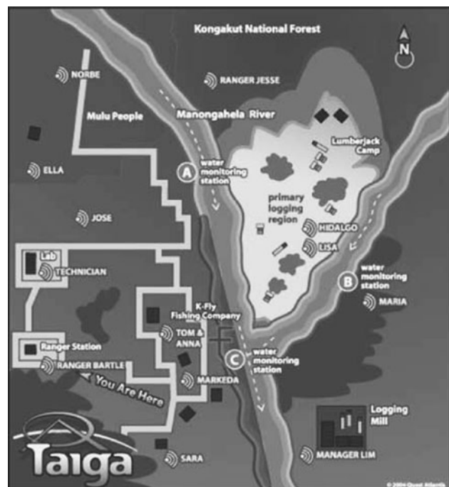
Fig. 3 A 2D map of the Virtual Taiga National Park

perspectives. The virtual world included two rivers (one starting in the Northeast and the other in the Northwest) that ran together in the center of the park (Figure 2 is a screenshot of the 3D park and Figure 3 is a 2D map). Different viewpoints are learned by navigating through the environment and clicking on any of the 13 non-player characters (computer bots). Clicking on one of the characters triggers a dialog tree in which the student selects statements to which the virtual character would reply. While selecting different choices revealed different specifics, the dialog trees and the content pages to which they were connected were designed such that, by the end of talking to the character, all students had access to similar information, although phrased somewhat differently. More