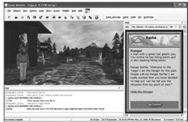
Fig. 2 Screenshot from the Taiga Virtual Environment

The underlying narrative then gets further fleshed out in greater detail as students navigate the virtual environment and click on non-player characters who share their diverse