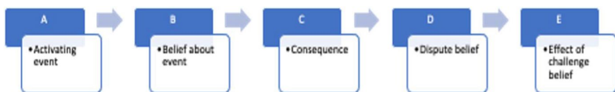
Fig. 3 ABCDE model (Ellis, 1962)

Specifically, Ghazali (1986) proposed a 5-construct model for the fortification of human nature in which the first step was the development of self-awareness: (i) “Knowledge of Self” (Ma’rifah al Nafs). Individuals were encouraged to find a life purpose that was congruent with the Islamic teachings, to set goals and to identify potential problems before (ii) setting off towards the Purification of the Heart (Takhalli), committing to overcoming negative qualities through understanding the life of the Prophets as described in the Quran and other relevant books. Once the heart was purified, the process of “Cultivation of the Heart” (Tahalli) started (phase iii). The aim of this phase was to build inner strength through remembrance (Zikr) and repentance (tawbah) and to export this renewed energy to the body and