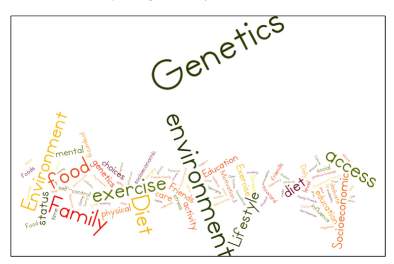
Fig. 2 Word map of premed majors' open-ended response to "What are the three most important influences on people's health?". Data are from 155 seniors who responded to a spring 2015 survey about the pre-health professional curriculum

literacy, health traditions and beliefs, physician bias) (Association of American Medical Colleges 2005), individual-level factors (genetics, individual lifestyle choices), and structural competency factors as defined by Metzl and Hansen (2014) (access to healthcare, health delivery system, insurance, institutional racism, medicalization, income, neighborhood, social policies). MHS majors were more likely to select one or more cultural factor (MHS: 75/85[89%]; premed: 55/70 [54%], p<.05) and less likely to select one or more individual-level factors (MHS: 25/85[29%]; premed: 34/70 [49%], p<.05) as one of the three most important factors explaining why childhood obesity rates are highest in the U.S. South (Table 4). MHS majors were also more likely than premed majors to select one or more structural factors