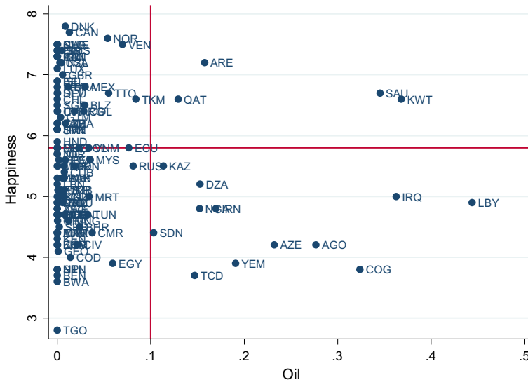
Fig. 2 Happiness and oil dependence. Note: Abbreviations correspond to 3-letter country ISO codes

*, **, *** correspond to a 10, 5 and 1% level of significance