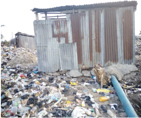
Plate 1. Latrine with a pipe emptying into a drain