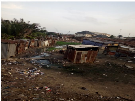
Plate 6: Atypical settlement point