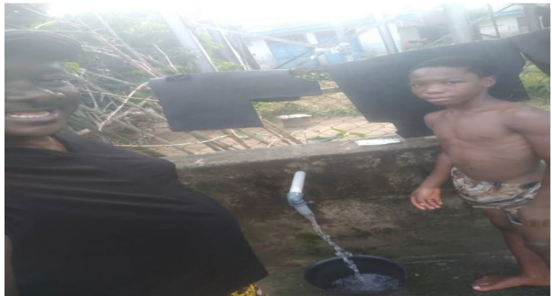
Plate 8: one of our co-authors in a private water point