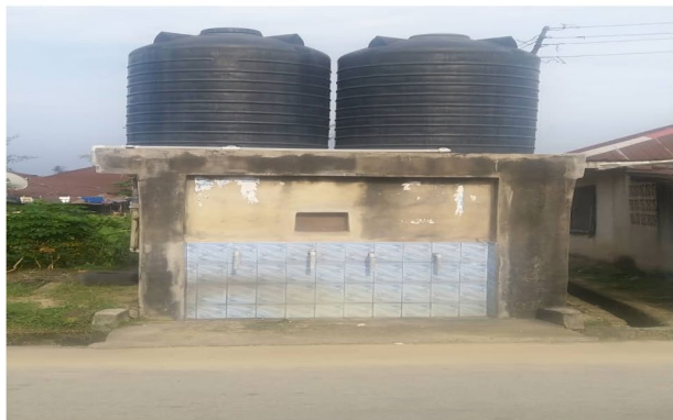
Plate 8: private/commercial water facility

realities, experiences and consequences associated with negotiating access to WaSH among women in slum dwellings.