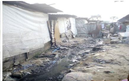
Plate 4: Drains in-between houses