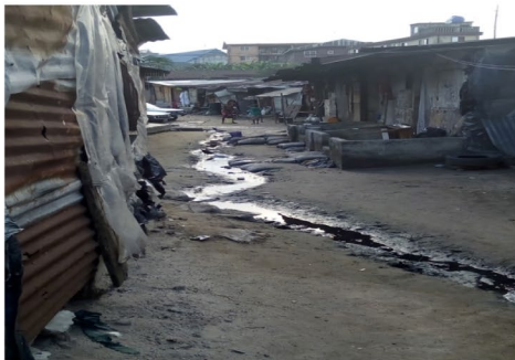
Plate 5: Makeshift houses