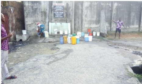
Plate 3: Water Collection point