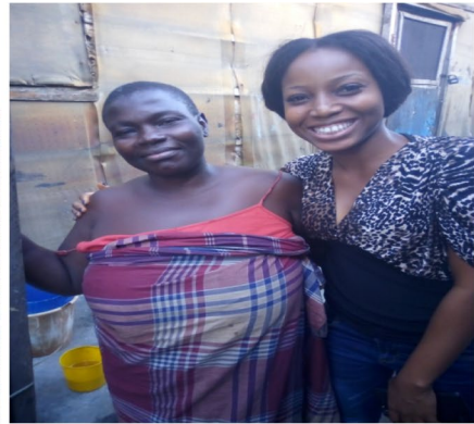
Plate 2. One of our co authors