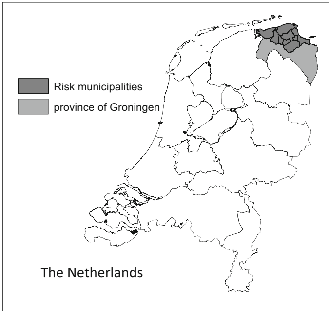
Fig. 1 Risk municipalities in the province of Groningen in the Netherlands

of it is generated by the Groningen gas field (Commissie Duurzame Toekomst Noord-Oost Groningen 2013). The natural gas is mined by the Dutch Petroleum Company (NAM), a joint venture of Shell and ExxonMobil. NAM expects to be able to produce natural gas in Groningen for another 50 years.