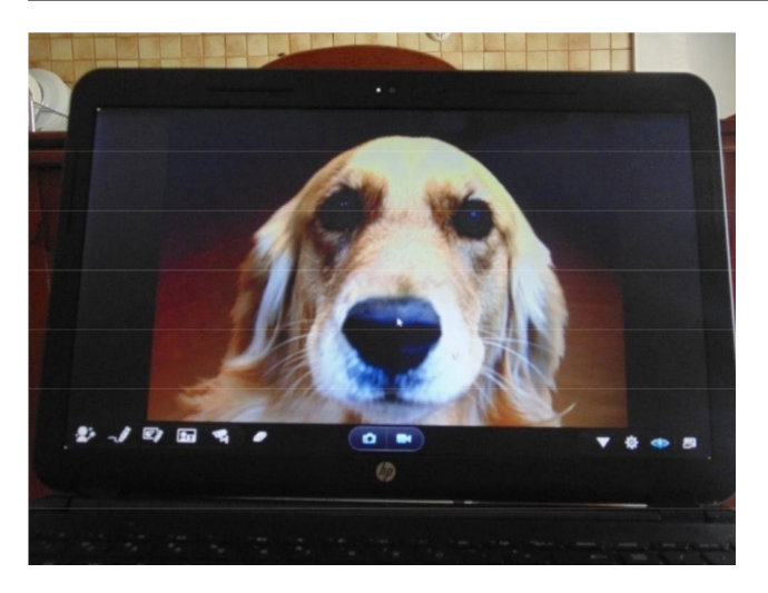
Fig. 4 Anna's dog

be there and sits with me. At night, I sometimes get nightmares, but when she's in my room, I don't. Some people may only see them as pets, but to me, they are like family and therapy.