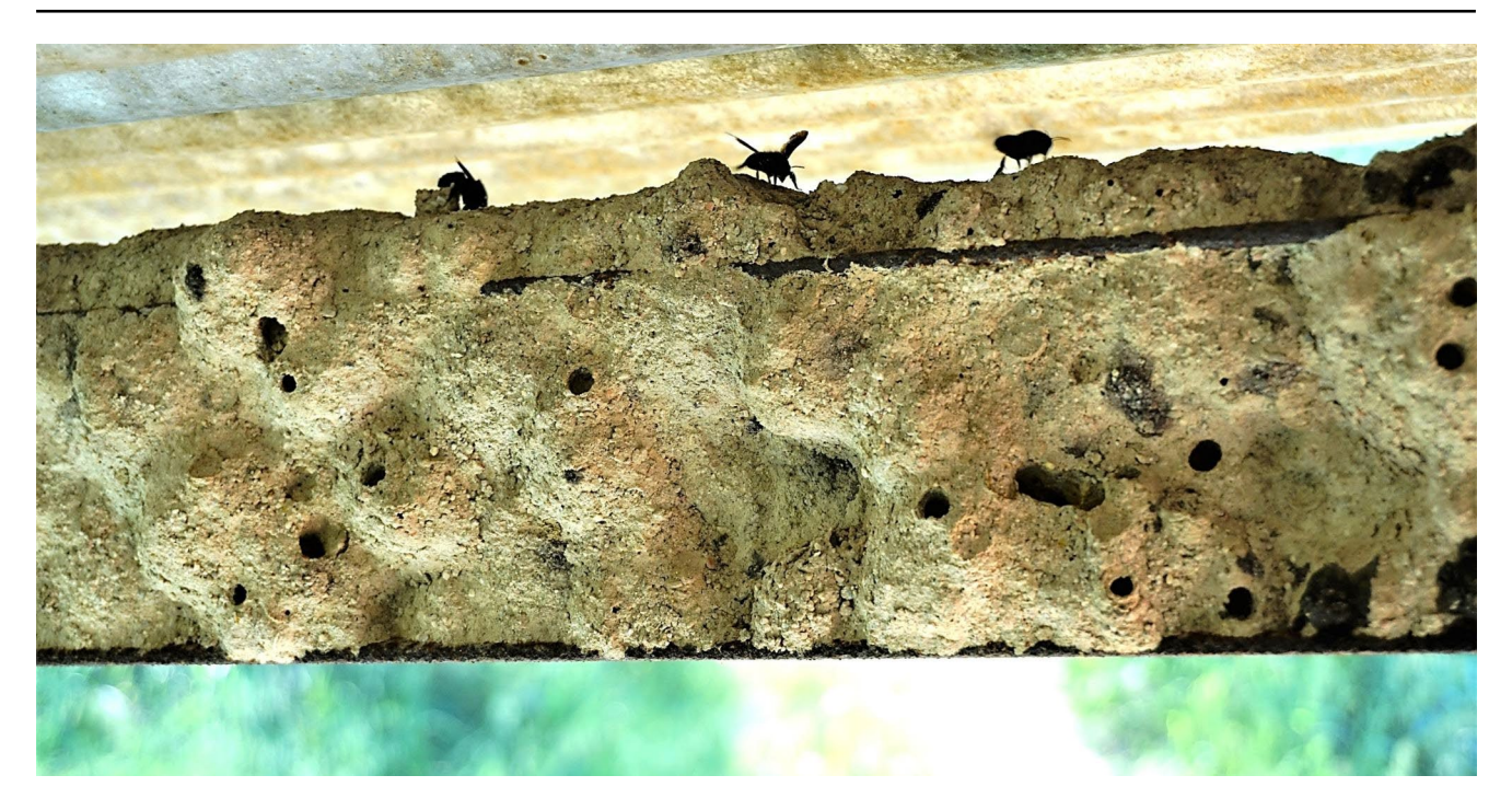
Fig. 1 A few cells within the studied nesting aggregation of Megachile parietina

on the walls of another shelter located at about 250 m, which some years earlier was sprayed with insecticides, according to the people living nearby. During spring 2017 the first aggregation was occupied by several dozen of M. parietina females, while we only observed few females on the second one; for this reason, specimen sampling was concentrated on the first nesting aggregation.