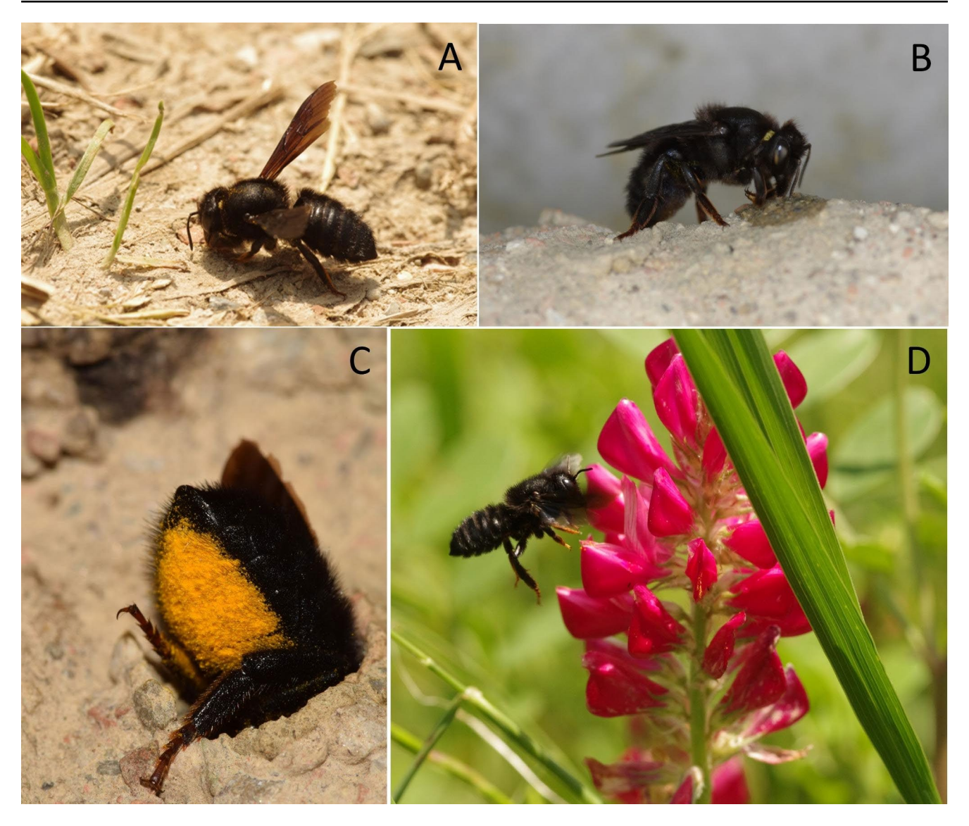
Fig. 2 (A and B) A Megachile parietina female collecting building material and modelling it on the nest. (C) Pollen on abdominal brushes (D) A female visiting Sulla (Italian sainfoin) (Hedysarum coronarium L.) flowers.