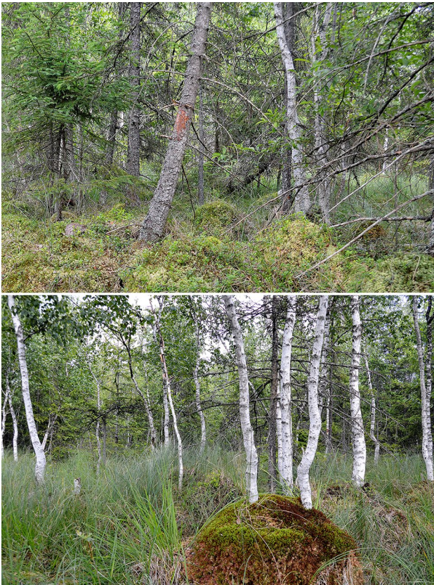
Fig. 1 Two sampled habitat types: pine forest bog (above) and birch forest bog (below)

possible effect of pitfall trap loss, the number of intact traps was used as random effect. If we found significant effect of forest type, we tested whether spider species diversity differed significantly among the two forest habitat types with constructing individual-based rarefaction curves and their respective 95% lower and upper confidence limits (iNEXT package, Hsieh et al. 2016).