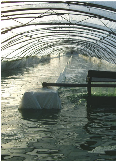
Fig. 3 Simplified inner structure of the culture pond and the greenhouse for Spirulina cultivation at Wulan Town, Ordos City.

By utilizing all the advantages and technical strategies above, the total annual production has increased sharply, the quality has been improved, and the production cost of Spirulina has decreased in recent years in Inner Mongolia.