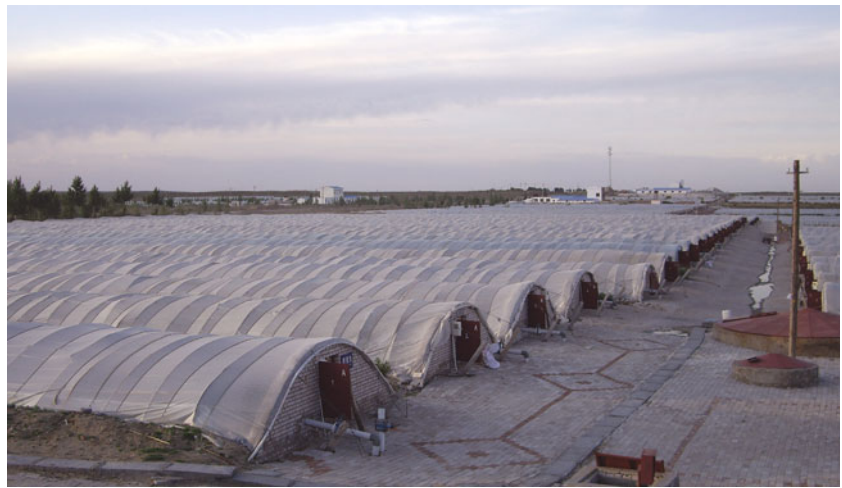
Fig. 2 A typical Spirulina plant with plastic greenhouse at Wulan Town, Ordos City; Photographed by Yong-Huang Wen

additional thermo-proof layer made of synthetic fiber cotton and covering the greenhouse of “seed” ponds. The “seed” culture is also electrically heated in several plants in this stage, which maintains culture temperature at over 25°C all day. By using these combined methods of temperature control, S. platensis or S. maxima , which are thermophilic algae (Vonshak 1997), can be used in this area as the “seeds” of large-scale cultivation.