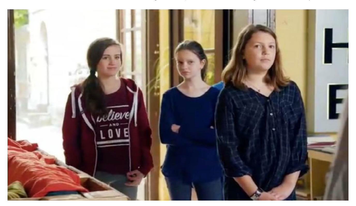
Fig. 1 An Example Trial of the Interpretation bias Social Picture Task, the Schloss Einstein-Radboud Socially Ambiguous Images (SERSAI). "New student: You are new at school and they would like to get to know you." (positive). "Strange student: You are new at school, but they don't want to get to know you." (negative)

In the second part of the task, participants indicated for each interpretation how likely they found the interpretations matching the scenario on a Visual Analogue Scale (VAS) from -100 = 'doesn't fit at all' to 100 = 'does fit completely' (i.e., the free evaluation part: 'How well do you think this