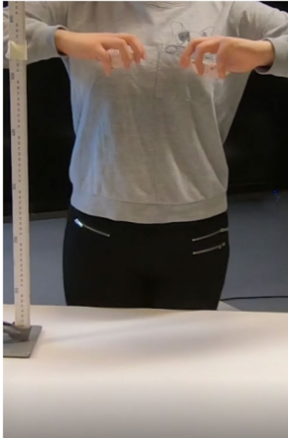
Fig. 1 A still picture included in the computer-based POE activity

was similar to the second one. In the third video, the cup piles hit the table seemingly at the same time, though a small time gap was observable if watched in slow motion. Thus, students were expected to make an observation that either the heavier (i.e. 32 cups) falls faster and the time gap between the falling times of the two objects was smaller than in the previous situation or that the cup piles hit the table at the same time. This third situation was thought to be contradictory or non-intuitive for most of the students, because of focusing only on the differences in the mass (Kavanagh & Sneider, 2007), which was kept constant throughout the three situations. During these three POE cycles, students were expected to observe the pattern in the phenomenon that as the masses of the muffin cup piles (objects) increase, the gap in their falling times decreases.