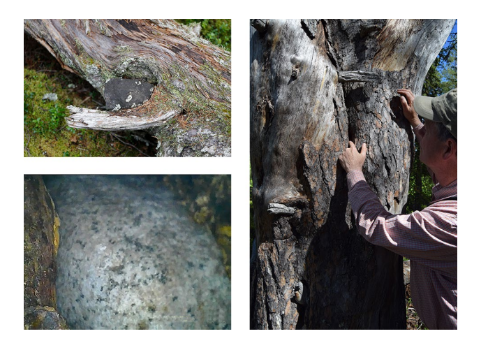
Fig. 4 Opening at the center of the tree (right picture), round granite stone (ca 25-30 cm in diameter) inside the tree (lower left picture) and inserted stone in into a branch on the tree adjacent to the Guoksik-gummo tree (upper left picture)

About two metres north of the tree, there is a down-log from another large Scots pine tree. This tree died around 1950 and fell sometime afterwards. It also has specific markings and features which connect it to the Guoksik-gummo tree: it has four blazes on the stem. One stone has been inserted into a branch attached to the stem (Fig. 4c). While the blazes are still visible, this secondary tree is severely decayed, and no dendrochronological analyses were made.