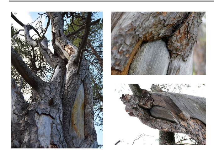
Fig. 3 Blazes on the main stem of the tree (left picture), large blaze on a branch 2,5m above the ground (lower right picture) and detail of that blaze with clear knife-mark on the upper part (upper right picture)

One of the most conspicuous features of the tree is that it has been blazed multiple times (Fig. 3). Seven open-face scars have been cut into the trunk and on the major branches of the tree. Many are markedly encroached, indicating they were made long ago; three scars have clear tool marks. Several attempts to date the scars have been made, but only one of these was successful. The wood inside most of the scars is severely decayed, and although it was impossible to extract tree rings that could be dated precisely, we suggest that most were made in the early- to the mid-nineteenth century. The only successful dating was the uppermost scar on one of the large branches, dated to 1834 (Fig. 3c). This particular scar also had a clear knife mark on the uppermost section.