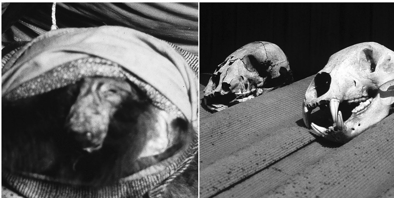
Fig. 3 (left) Clothed Bear's head and forepaws preserved for home veneration, Tromegan River; (right) Bear skulls placed on roof for protection, B. Yugan River

for me.' And now when the bears catch reindeer they do eat it only until the small bones are left. Those bears really were misbehaving.