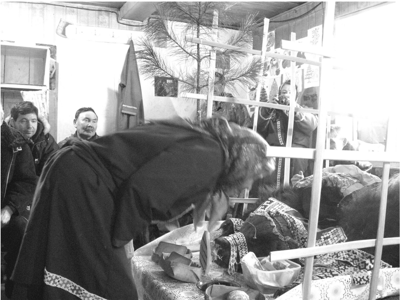
Fig. 2 Greeting the Bear Guest at the bear ceremony with a kiss

So that you could shoot him? (He avoids the word "shoot") ] I yelled at him so that he should show himself, and not hide. He killed my reindeer.