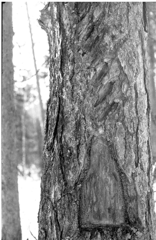
Fig. 4 Tree marked after successful hunt