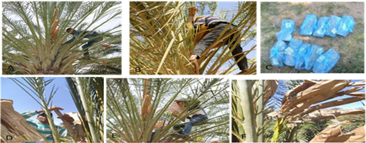
Fig. 1 Various cross-pollination process steps include: A: Using Kraft paper to wrap the female bunches before flowering will help prevent pollen contamination. B: Separate each bunch into 12 groups, with 5 strands in each group, then wrap each group in Kraft paper. 11 different date palm cultivars' pollen sources, C: introduction of two male pollen strands into each

female group; D: closure of the envelopes following pollination. The worker cleans his hands with 95° alcohol after each pollination to get rid of any remaining pollen contaminants. E–F: In order to track the growth of fruits concerning their particular pollinator, each female strand group was marked with a different colored tape