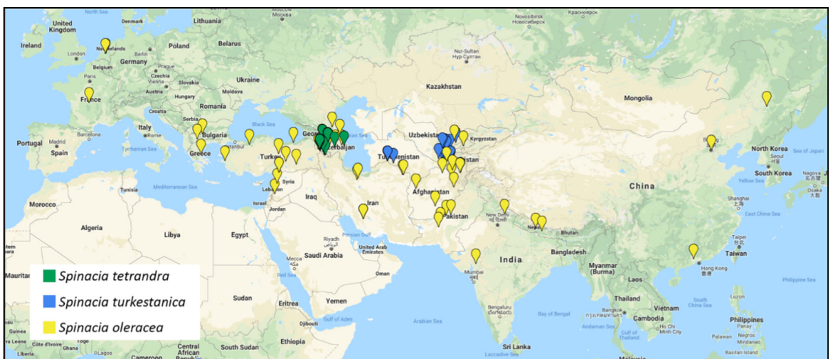
Fig. 1 Geographical map of the origin locations of the 95 study accessions

The genetic markers used in our study were selected from a total of 419 SNP markers identified and used by Chan-Navarrete et al. (2016) for genetic map construction in spinach. These SNPs showed polymorphisms between the S. oleracea cultivars ‘Ranchero’ and ‘Marabu’. Each SNP and its flanking DNA sequence (50 bp upstream and 50 bp downstream of