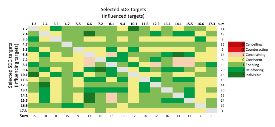
Fig. 2 Assessment of interactions between nationally relevant SDG targets

hampers the implementation of other targets. Both low and high row sums suggest that a special attention should be directed to the implementation to the target in question. However, the sum values are indicative, and they should not be looked at in isolation because they may include considerable uncertainties and mask countering impacts.