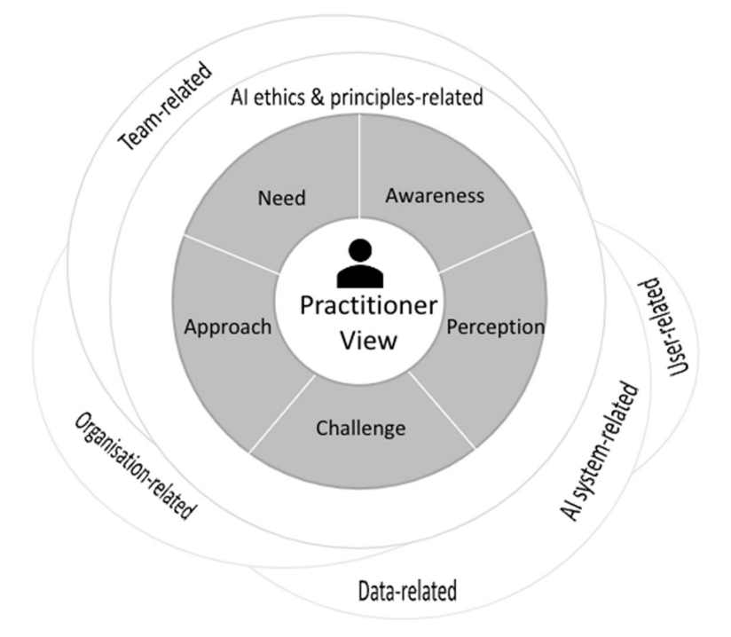
Fig. 5 An overview of the aspects of ethics in AI from AI practitioners' viewpoints

they use unless there is any chance of an incident occurring [G3]. Likewise, they reported that users don't have much knowledge about AI which makes them uninterested in the ethical aspects of AI-based systems [G7]. No challenges or needs related to users were reported in the literature that impact AI practitioners' AI ethics implementation in AI-based systems. In conclusion, AI ethics and principles and team-related aspects were front and center for AI practitioners while they lacked a better view of the user-related aspects. Our findings contribute to the academic and practical discussions by exploring the studies that have included the views and experiences of AI practitioners about ethics in AI. As we conducted a grounded theory literature review (GTLR), we got an opportunity to rigorously review the primary empirical studies relevant to our research question and develop a taxonomy. We now discuss some of the insights captured through memoing and team discussions, accompanied by recommendations.