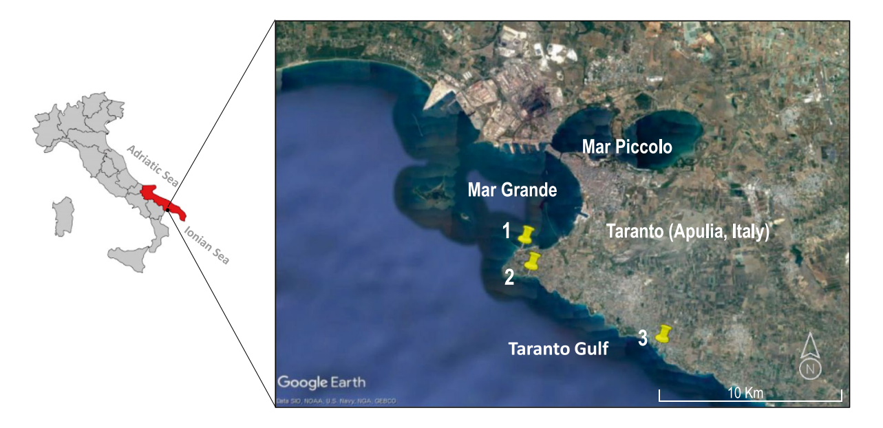
Fig. 1 Map of the sampling locations in the Taranto Gulf, Ionian Sea, Southern Italy

Samples of seawater (1 L) were taken approximately 2.5 m from the beach line and approximately 30 cm below the sea surface using a telescopic rod