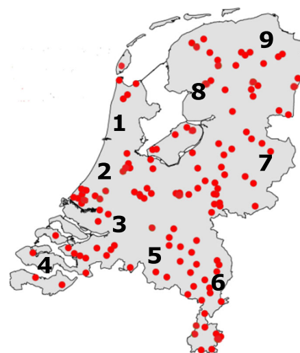
Fig. 1 Location of the apiaries sampled. Numbers 1–9 indicate the postal codes zones 1–9

Of the metals not detectable in an apiary sample, 1/2 limit of detection (LOD) value is set in the database. Per metal in the 150 apiary dataset, the median, lower quartile (25 % percentile), upper quartile (75 percentile), arithmetic mean, min/max and standard deviation (SD) were calculated.