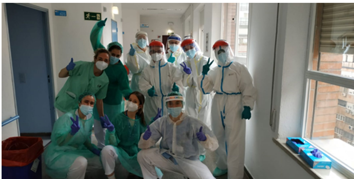
Fig. 1 Auxiliary nurses in Hospital Universitario de La Princesa, April 9, 2020

We must live in this planet, there is no other Earth or planet/plan B. And we have observed that air pollution and Planetary Health can be improved within weeks, with concerted individual and societal efforts [6]. Children confined at home for 3 weeks already, have appreciated playing with their brothers and sisters, or talking with neighbors across the balconies; even remotely with their school friends and teachers. They should be the first to