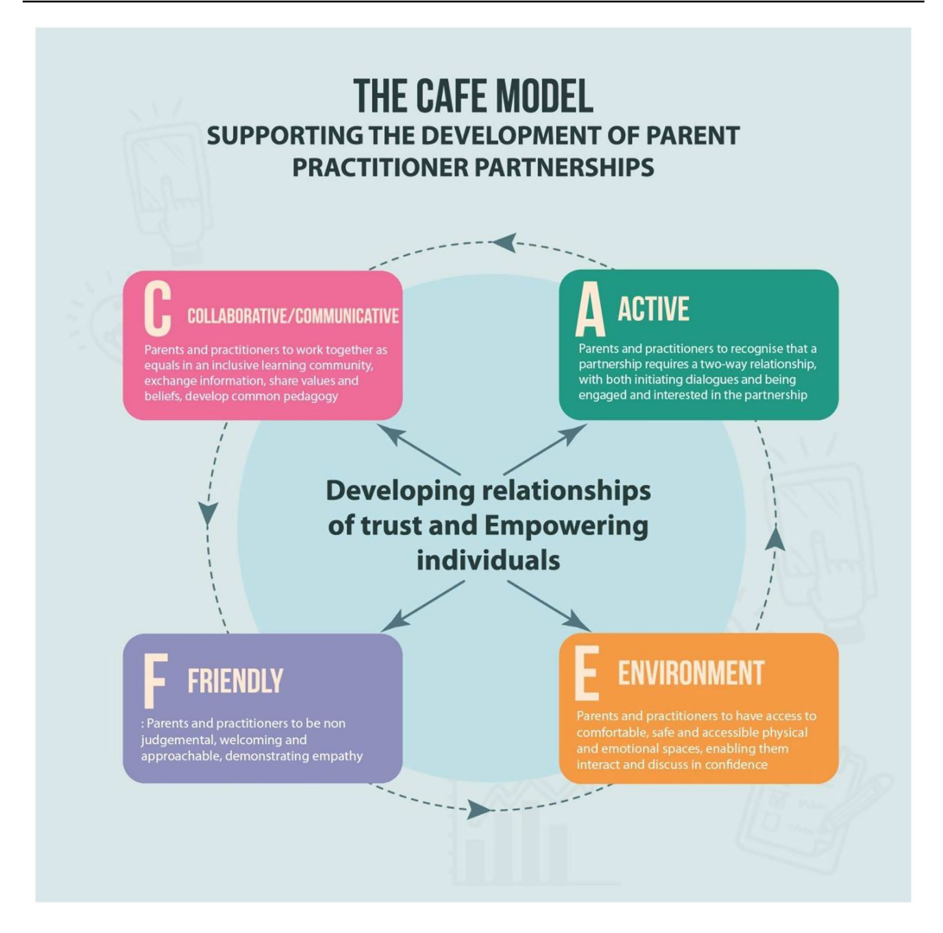
Fig. 1 The CAFE model: supporting the development of parent-practitioner partnerships

upon and form the basis of further communications. The CAFE model also builds on the third point, highlighting that this must be a two-way relationship which requires the provision of a safe space, whether that is virtual or face to face.