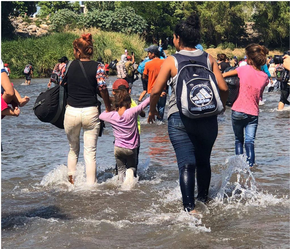
Photo Caption: Migrant caravan crossing the Suchiate River between Guatemala and Mexico. 2018

Now international criminal cartels, drug cultivation, and trafficking corridors abound. Local gangs with ties to larger networks of criminality operate throughout the region with a flourish. As a result, ordinary people live under the threat of gang activities that include kidnapping, sexual assault, and extortion, one of its principal sources of income. Refusal to pay is considered an affront to gang authority that is in turn met with threats, violence, and even death. In 2014, 20% of all murders in Guatemala were due to failure to pay extortions. According to a recent study by Doctors Without Borders (2020) 2/3 of the people from the Northern Triangle countries seeking refuge have experienced the murder, disappearance, or kidnapping of a relative before their departure. Moreover, there has been a substantial increase in violent crimes exacerbated by the proliferation of firearms imported from the US since the ending of the counterinsurgency wars. Over the past decade the three Northern Triangle countries have consistently been ranked in the top five countries in the world not at war for homicide and femicide.