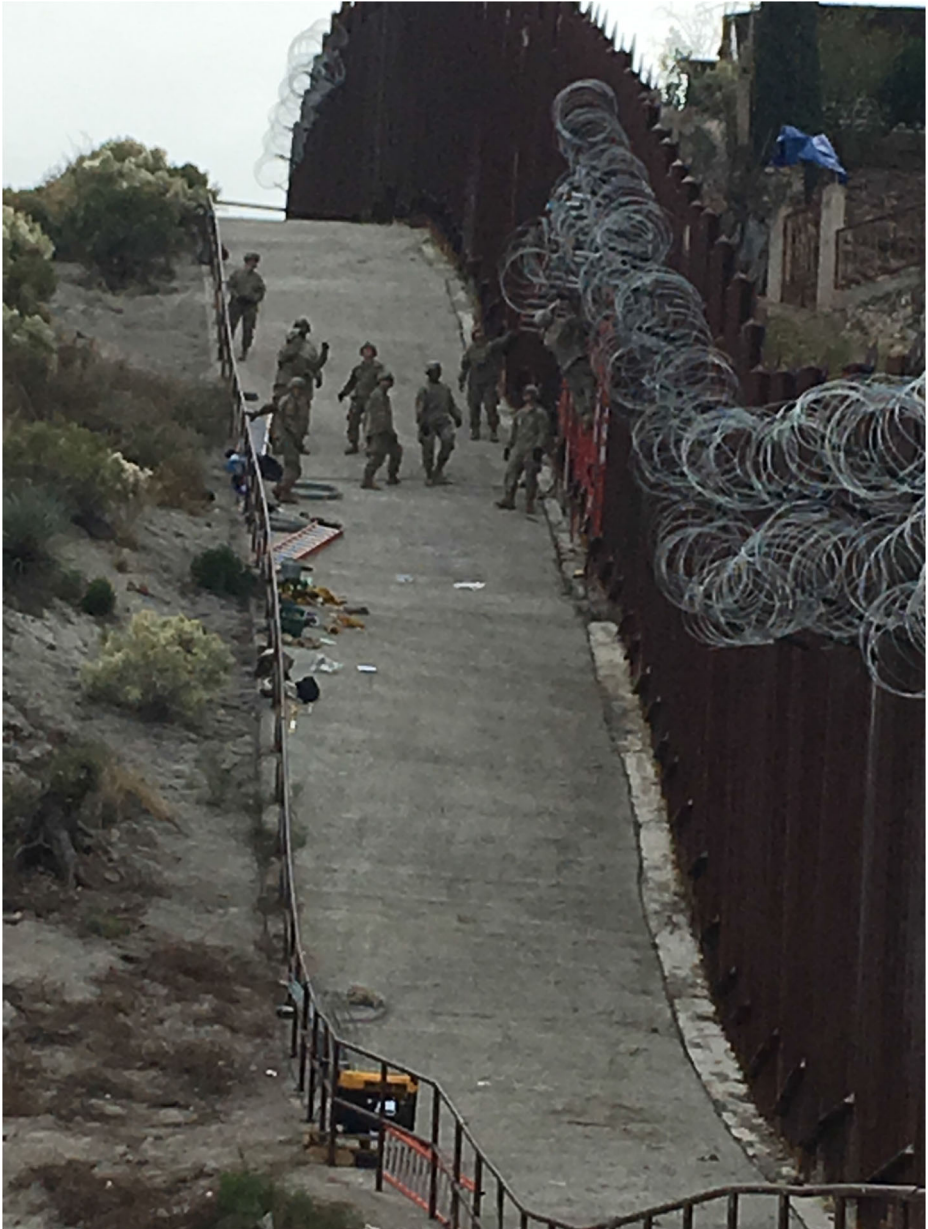
Photo Caption: US Military deployed from Ft. Bliss, TX, to the border at Nogales, AZ, to fortify the wall with concertina wire. December 2018

+Asylum Transit Ban is perhaps the most blatantly absurd of all. Beginning in July 2019 any individual seeking asylum at the southern border who passes through another country enroute must apply for asylum in that country. So, if you are fleeing the violence in Honduras you are obliged to apply for asylum in Guatemala, even as Guatemalans are fleeing the violence there.