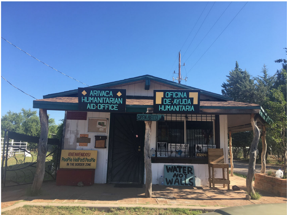
Photo caption: The central humanitarian aid office in the town of Arivaca, population 700. The Byrd camp is located in a valley southwest of the town