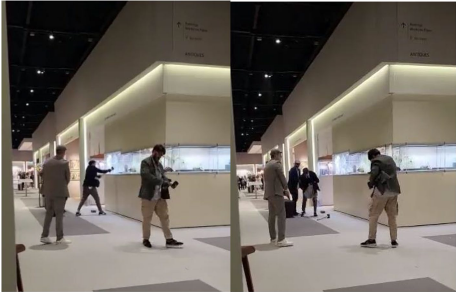
Fig. 5 a, b Stills from the first heist video. Left: the thieves violently smash glass with a sledgehammer as a crowd of onlookers forms in the background. Right: The crowd has grown as the thieves place the jewels in a bag; note the man on the left appears to be holding a gun.