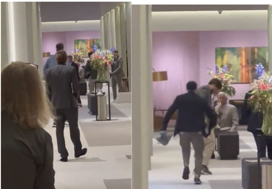
Fig. 6 a, b Stills from the second video. Left: onlookers casually enter the frame to watch the heist. Right: the older man in the gray suit sits as the heist occurs around him. Screen shots by Yates, 14 Feb 2023