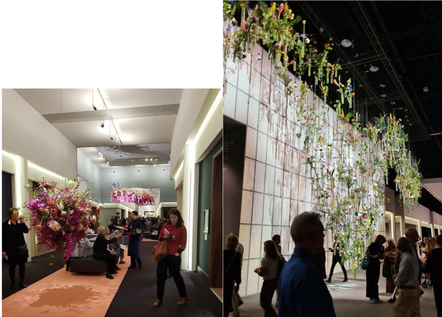
Fig. 4 a, b Extensive displays of flowers contribute visually and olfactorily to the atmosphere of TEFAF 2020 (left) and TEFAF 2022 (right; taken the afternoon before the heist).

is so ingrained, and these affective expectations are so expected, that challenges to the uniform take the form of apocryphal stories that dealers share.