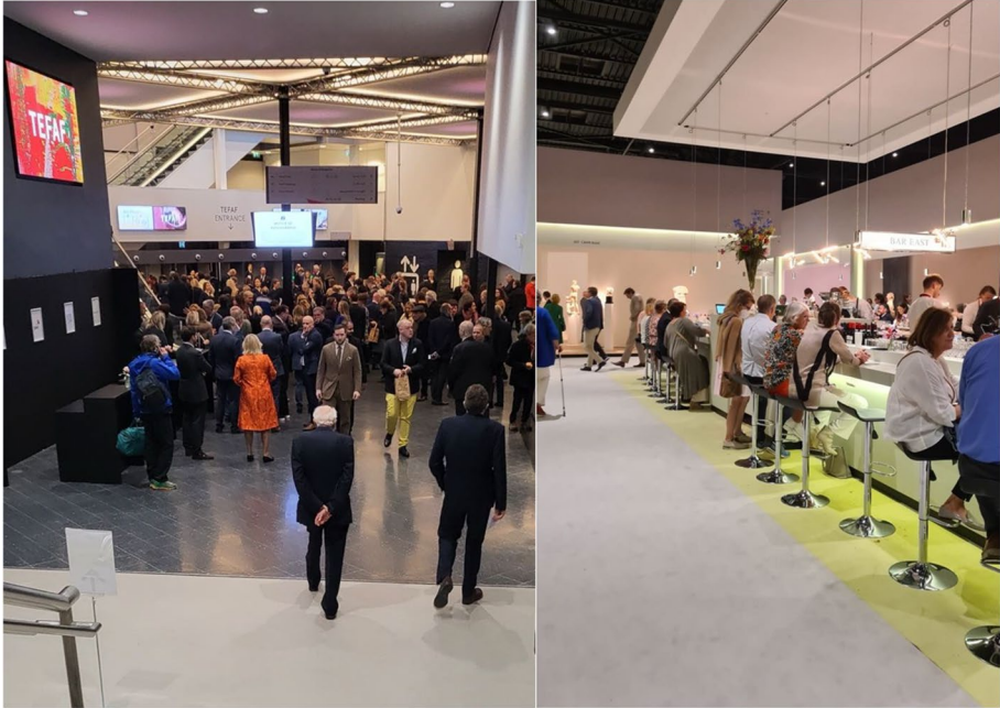
Fig. 3 a, b The TEFAF “uniform” within the visual atmosphere of the fair; TEFAF 2023 entrance (left) and TEFAF 2022 bar (right, the afternoon before the heist). The outfits from 2022 are noticeably more casual, but the attendees still wear long sleeves and blazers. The reader should note that in June 2022, it was approximately 29 degrees Celsius outside and the TEFAF venue had no climate control.

well-fitting trousers, leather shoes, and muted but expensive tie clips, rings, etc. Some wear exceptionally fitted suits. Women, too, wear exceptionally fitted suits, designer dresses, or blouses with expensive trousers or skirts. Many wear heels and jewelry, and the norm is impeccable makeup and hair. TEFAF attendees skew older and more conservative dress-wise, with the artsy and streetwear styles seen among attendees at Art Basel, for example, usually not present at TEFAF. Particularly among younger fair attendees, dark rimmed glasses are ubiquitous. Flat caps are observably present (Fig. 3).