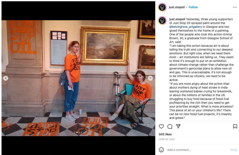
Fig. 10 Protesters glued themselves to a painting at the Kelvingrove Gallery in Glasgow on the day after the TEFAF heist, image posted on the just.stopoil Instagram account ( https://www.instagram.com/p/CfbWRYwN5vq ).