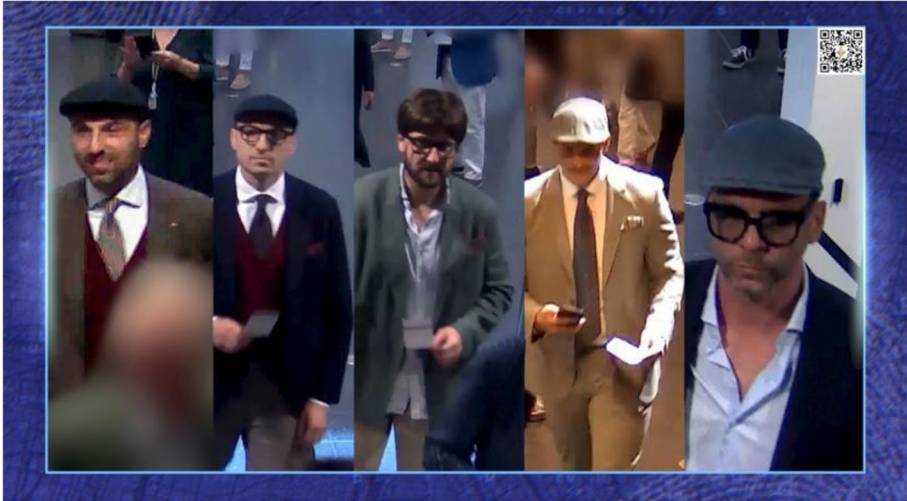
Fig. 1 The five suspects in the 2022 TEF AF heist.