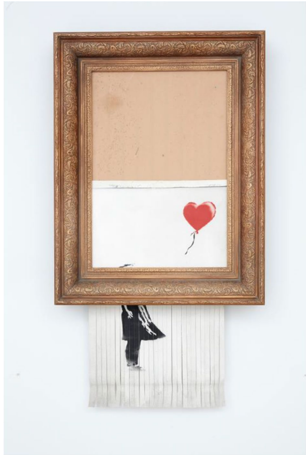
Fig. 8 Love is in the Bin by Banksy, note the shredding.