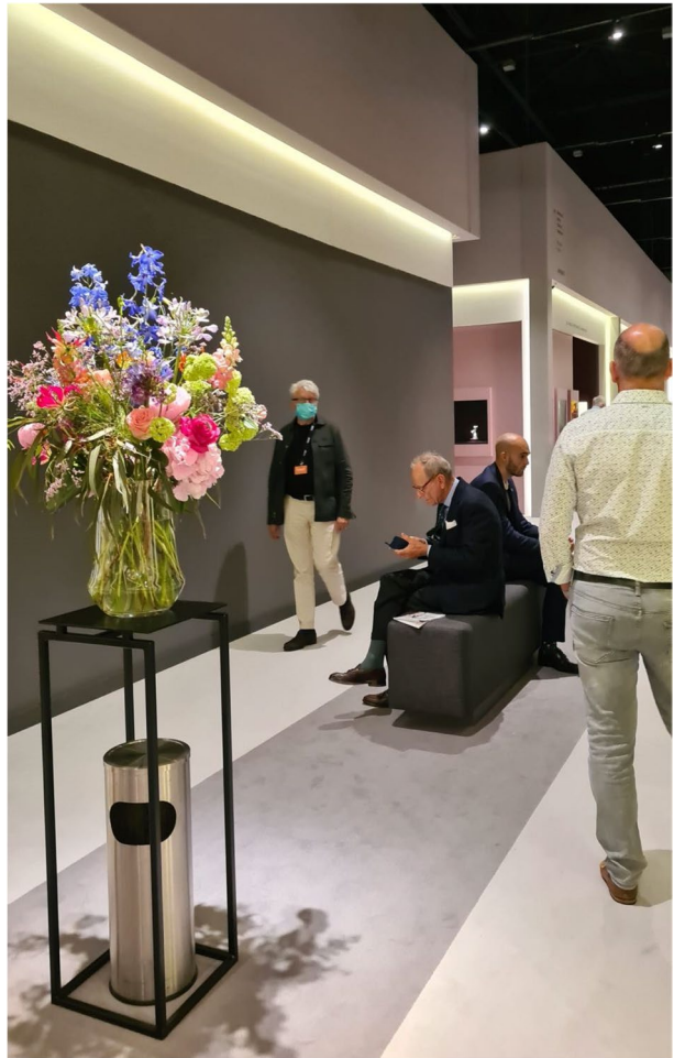
Fig. 11 “Business as usual”. By the day after the fair, all evidence of the heist had been erased, the stand that was robbed had been neatly covered by a dark gray space, the flowers had been rearranged, and suited men were once again sitting in front.

The prevailing counter concern at the fair the day after the heist among dealers was how very hot it was in the exhibition hall. Several fair participants said something along the lines of “I care more about this heat” than the heist. That the heat was the primary concern of multiple people we spoke to is, perhaps, not what an outsider would predict in the wake of a violent armed heist. However, within the context of the art fair, that too made sense. TEFAF usually takes place in March but had been postponed to June in 2022 due to the COVID pandemic. The facility’s lack of climate control in the June heat made numerous exhibitors upset. To recall back to the previous section, the TEFAF uniform of a blazer or suit did not work well at those temperatures, and some dealers were concerned with how the heat would affect their artworks. Others felt the heat discouraged buyers from buying.