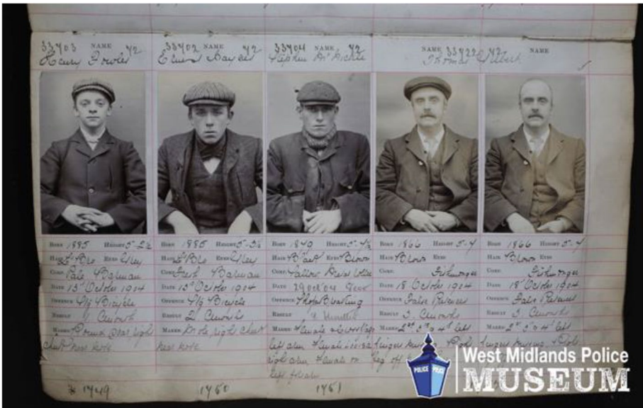
Fig. 2 Period mug shots of five members of the original Peaky Blinders street gang.

to the fair becomes a display of not only the financial ability to engage in the world of high-value art, but also becomes an objectified manifestation of the embodied cultural capital of the wearer (Bourdieu, 1986). Attendees of art fairs attempt to dress towards