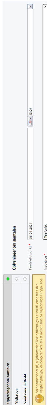
Picture 4 Screenshot of the system, when the caseworkers document a remote consultation. The yellow box says: “Pay attention: this type of consultation does not necessarily count, as the unemployed person is not participating in an activity. See guide on the right side”.