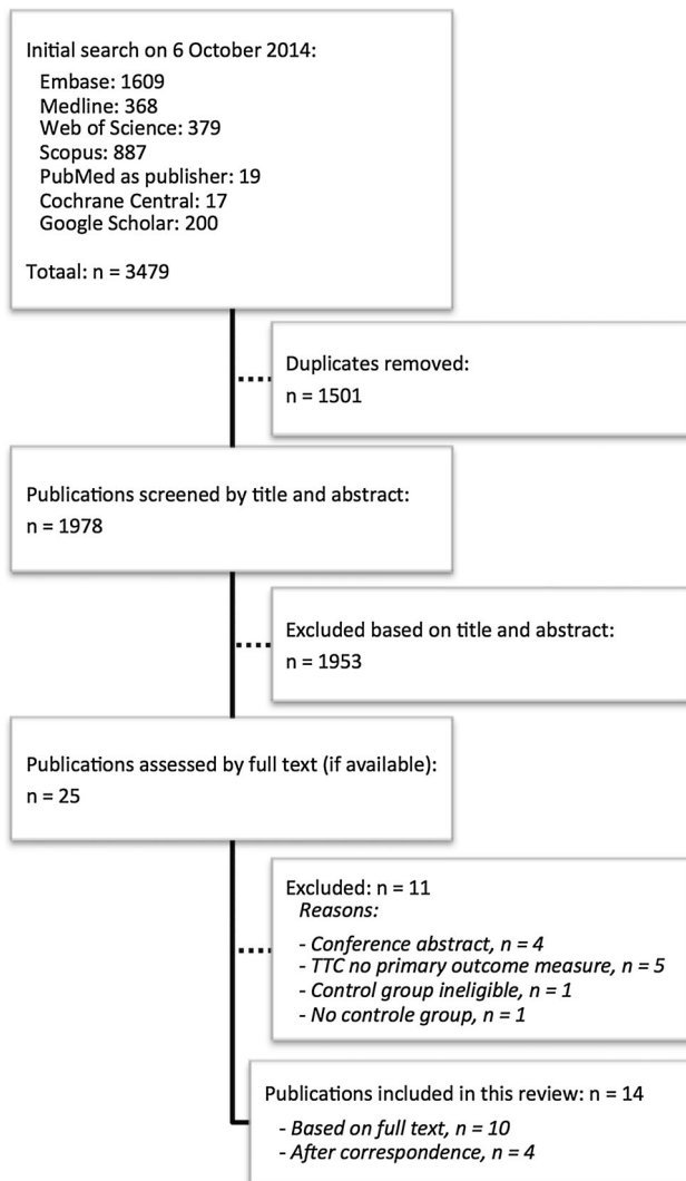
Fig. 1 Flowchart of the study selection procedure

[7, 16–28]. The initial consensus between the reviewers after screening of title and abstract was 99.4 %. Screening of the reference lists of the included papers did not result in the inclusion of additional studies. Four studies were included only after essential information was acquired through correspondence with the authors [19, 20, 25, 27]. Extra information was received for three other studies as well [7, 21, 23].