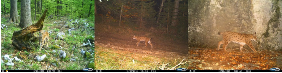
Fig. 2 Three different types of camera trapping sites with lynx captures (from left to right): marking site, road and other

camera-trapping sites with two cameras set, following the camera trapping guidelines from Stergar and Slijepčević (2017) to optimize lynx identification (see Sect. 3. for further details). We used cameras with white flash (CuddeBack X-Change Color Model 1279, Cuddeback, Green Bay, Wisconsin) at sites where we expected lynx to pass by, and cameras of the same model with black (940 nm light wave) or regular infrared light (850 nm light wave) (Stealth-Cam STC-G42NG, Stealth Cam, Irving; Moultrie M40-i, PRADCO Outdoor brands, Birmingham; LTL Acorn models Ltl-6310WMC and Ltl-6511WMC) at sites where we expected lynx to stop for scent marking to avoid disturbing it with flash (Stergar and Slijepčević 2017).