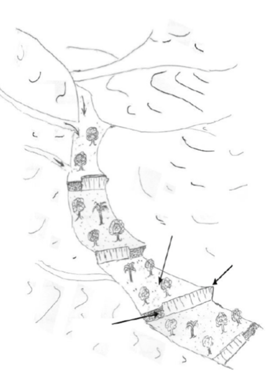
Fig. 3 The sketch shows the different part of jessour structure: the dike, the weir and the arable land behind the dike (the terrace itself)

• The terrace: it is the reservoir where the fertile runoff accumulates. This is where the local population practice arboriculture (olive trees, fig trees, almond trees, palm trees) and annual crops (barley, bean, lentils, wheat).