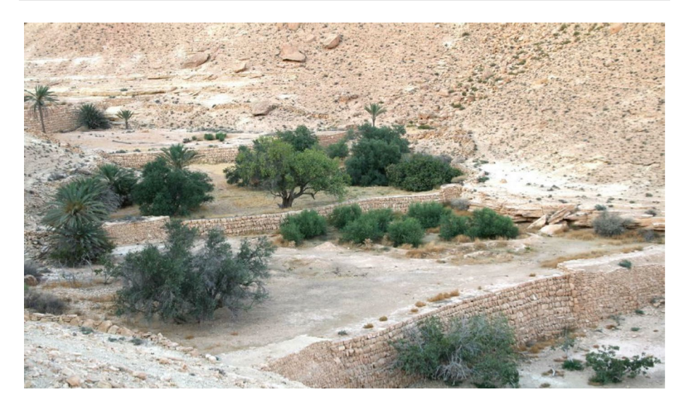
Fig. 6 Example of vegetation watercourse jessour. From the picture it is clear the drystone walls distribution along the water course and the way they are built. Most of the tree trunks are buried under layers of soil which have settled over the years