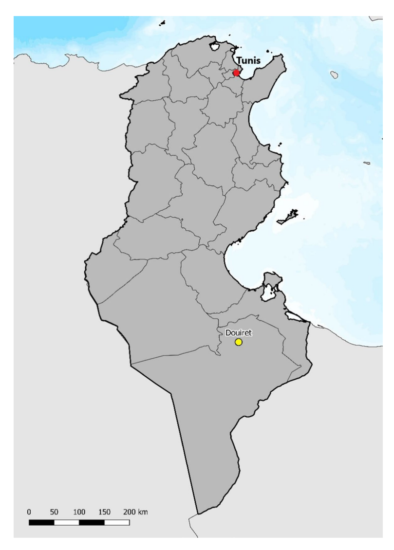
Fig. 1 Location of the study area in Tunisia

The study area is located in the south of Tunisia, at 570 km from Tunis city and at 21 km from Tataouine (Fig. 1). The area is hard to be delimited by natural features or administrative borders: the surface doesn't offer any features to clearly find a contour, while the administrative borders—the imadats of Douiret and Nouvelle Chnini—includes a vast area of sandy desert. Due to these reasons, the border of the site has been delimited with a circular area, 4 km radius, covering the jessour area nearby Douiret.