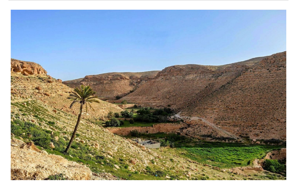
Fig. 2 The jessour system in a watercourse

Fig. 3 The sketch shows the different part of jessour structure: the dike, the weir and the arable land behind the dike (the terrace itself)