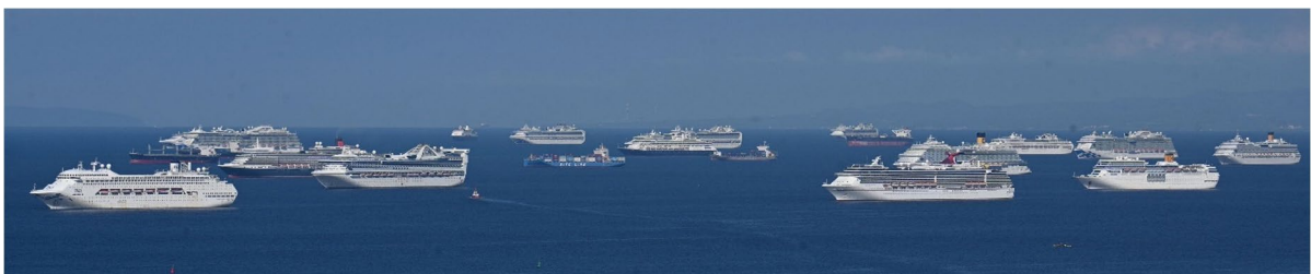
Fig. 2 Cruise ships aggregated at anchor at Manila Bay, Philippines (May 31, 2020), in response to COVID-19 disruptions and restrictions.

45 days before and after. Port brightness is proportional to number of visits during this period (totals: 346,501 separate port callings, 3889 unique ports and anchorages, 6693 unique vessels). Data provided by S & P Global