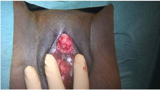
Fig. 2 Clitoral tissue is visualized during the clitoral reconstruction procedure, after the excision of the cutaneous scar