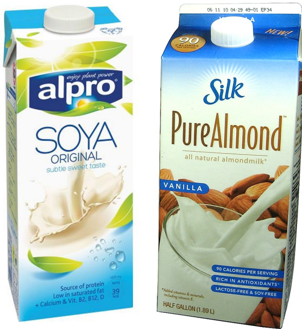
Fig. 2 Alpro and silk packaging