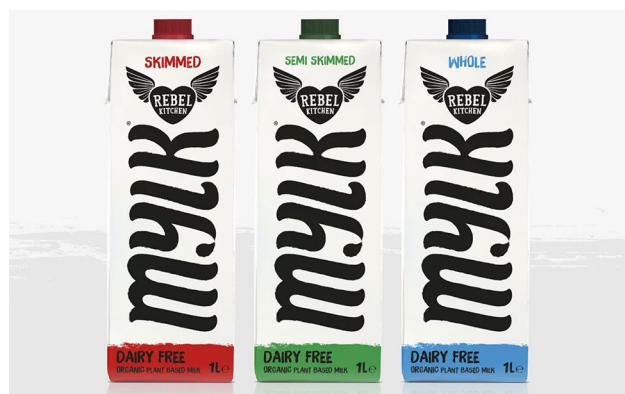
Fig. 5 Rebel kitchen cartons

brands, such as Oatly and Rebel Kitchen, offer ‘skimmed’ and ‘whole fat’ versions, in the latter of which fats are added to mylks (Fig. 5). This process is reminiscent of industrial dairy milk production, which skims all milk and adds fat back as needed.