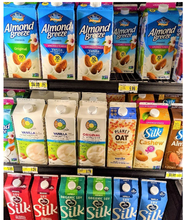
Fig. 3 Refrigerated mylk in supermarket. Photo by Nathan Clay, 2020

When it comes to taste, some mylks (such as Rude Health and Plenish) claim to replicate the refreshing, 'pure' taste of (chilled) dairy milk, and to derive this purity from using only few ingredients. Many brands include flavorings, stabilizers, emulsifiers, and refined sugars in an effort to mimic the texture or mouth feel of milk. A carton of Rebel Kitchen Mylk exemplifies this, claiming 'what we all really want from a dairy free alternative is that it tastes & looks just like real milk. Right?' In trends comparable with dairy milk, many mylks are also flavored, most often with vanilla, in ways that explicitly depart from the claimed blandness of pure milk. As we examine in detail below, the form and style of the packaging often purposively resembles that of commodity dairy milk. Mylks are also sold in ways that resemble dairy milk, located in refrigerated aisles adjacent to dairy milks (Fig. 3) or next to the UHT milks in the ambient aisles. Likewise, in coffee shops, which have proven to be crucial spaces in which consumers first try mylk, they are sold with