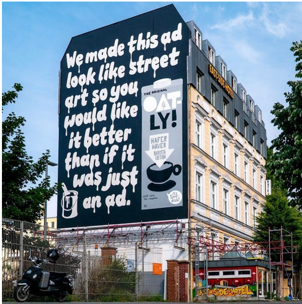
Fig. 6 Oatly billboards

as ‘it just becomes lame when you start preaching it in your communications’, but it also requires a veneer of transparency to acknowledge consumers’ distrust of advertising (Rogers 2019). Advertising commentator Jamie Williams (2019) explains how Oatly has pioneered a tactic known as ‘unadvertising’, which mocks the traditional advertising formula. This style takes the intertextuality of ironic advertising to another level, repurposing the subversive tactics of the 1990s anti-capitalist Adbuster movement in an effort to overcome widespread cynicism about the social role of advertising (Lasn 1999).