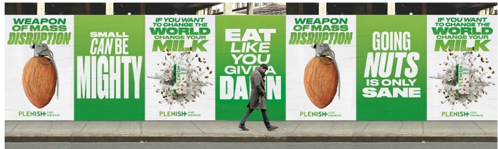
Fig. 1 PlenishDrinks advertisement