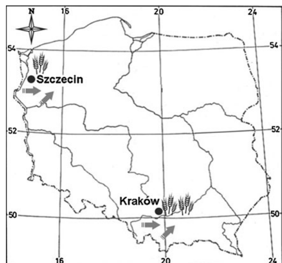
Fig. 2 Map of Poland showing the monitoring sites and their coordinates: Szczecin—149 m a. s. l.; 53°25′N, 14°35′E; Kraków—220 m a. s. l.; 50°03′N, 19°57′E. Arrows—prevailing wind directions; cereals—locality of croplands

Both cities are surrounded by forests, farmlands and abandoned farmland areas, which provide suitable media for the spore production. The present, ‘baltic’ climate of Szczecin is influenced by the impact of the air masses from over the northern Atlantic and is characterized by mild winters and cool summers. Cracow is situated in a region where weather changes are frequent due to the friction of both humid air masses arriving from over the northern Atlantic Ocean and dry, continental masses of air incoming from the east. In Szczecin and Cracow, the mean annual precipitation is relatively