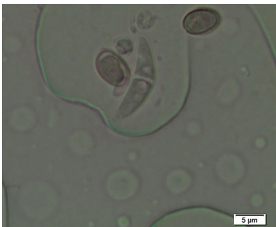
Fig. 1 Didymella ascospore (Szczecin)

Allit (1986) found that hyaline, one-septate ascospores reached high levels following rainfall during July and August. The majority of these spores belong to various species of Didymella . The high spore