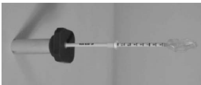
Fig. 2 Single-use catheter–balloon cartridge

can be administered. The device can remain in the treatment-ready state for 35 min before it automatically shuts down (Fig. 3).