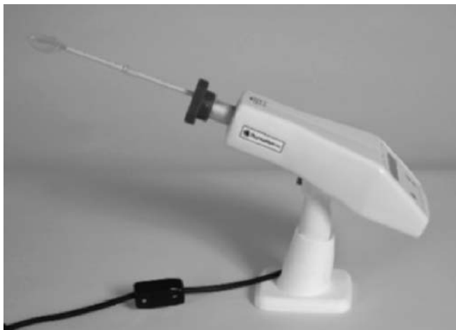
Fig. 1 Thermablate EAS with cartridge partially exposed