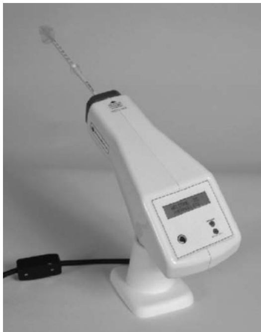
Fig. 3 Assembled Thermablate EAS with view of LCD

During treatment the TCU performs a series of pressurization and depressurization cycles to homogenize the temperature of the liquid in the balloon ensuring uniformity of energy and treatment at the balloon surface. Automatic adjustment of the pressure to 180 mm Hg is done every 10 s with the total treatment time being 128 s (2 min 8 s). Tissue necrosis to a uniform depth of 4–5 mm into the myometrium has been demonstrated in pre-hysterectomy studies. Balloon design provides lesser penetration of approximately 2 mm depth in both the cornual and internal cervical os areas. At the conclusion of treatment, the liquid is automatically withdrawn from the balloon into the canister which is then removed from the endometrial cavity and disposed. The higher temper-