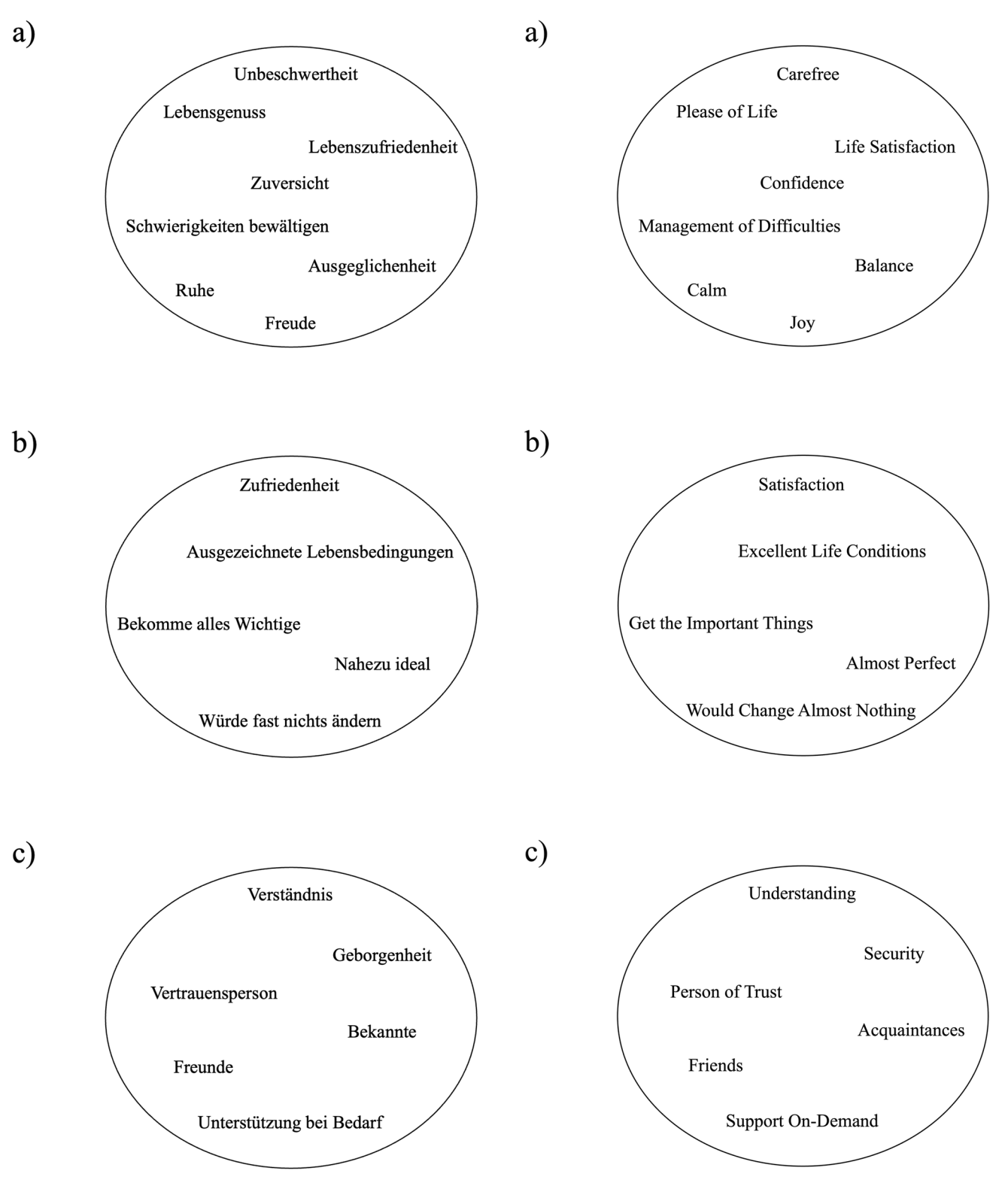
Fig. 1 Original German language Bubbles: a) Positive Mental Health Bubble; b) Life Satisfaction Bubble; c) Social Support Bubble