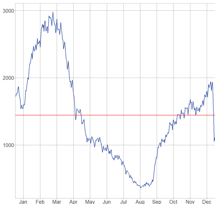
Fig. 2 Daily number of hospitalisations for pneumonia in children, in Poland, in 2014

after pneumococcal vaccine introduction (Tong et al. 2018). Nguyen et al. also observed a considerably high percentage of children aged up to 4 years in the population of Vietnamese children hospitalised in three hospitals. Depending on the hospital category, the percentage within this age group ranged from 78.6% to 91.2%. The youngest children, aged up to 2 years, contributed to the percentage considerably. They required hospitalisation nearly three times more often than the group aged 2 to 4 years, and seven times more frequently than children aged 6 to 14 years. The percentage of hospitalisations in the entire population of Vietnamese children among boys was higher than that in Poland (63.8% vs 55.9%) (Nguyen et al. 2017). In a South Korean study, 44.9% of all the pneumonia patients were children younger than 10 years (Health Insurance Review & Assessment Service 2014). In the study by Lee et al. the hospital admission rate was 43.5%. The highest percentage was observed in the subgroup aged 1 to 3 years (Lee et al. 2016). In the multicentre Etiology of Pneumonia in the Community (EPIC) study, children aged up to 4 years accounted for nearly 70% (Jain et al. 2015).