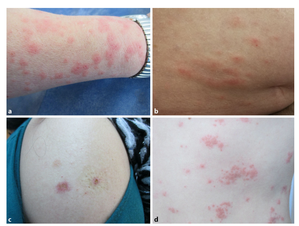
Fig. 2 Other cutaneous findings after SARS-CoV-2 vaccination. a , b Morbilliform rash. c Small indurated plaque. d Herpetiform rash

leukocytes [25]. Possible "allergic" constituents other than PEG include polysorbate, tromethamine (hydroxymethyl)aminomethane (TRIS) used as a buffer ingredient, and glycerophospholipids which are substrates for phospholipases A2 which is known for proinflammatory activity. Glycerophospholids are a constituent of mRNA-1273 [26]. Lipid nanoparticles may directly activate mast cells after phagocytosis or activate complement components [23].