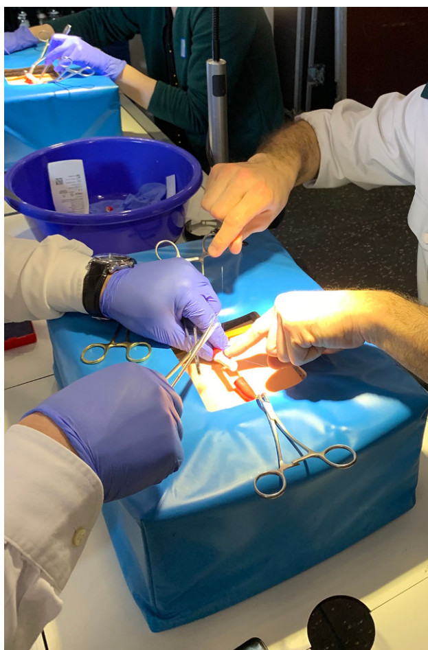
Fig. 2 Participants performing an interpositional graft in a box with pulsatile artery