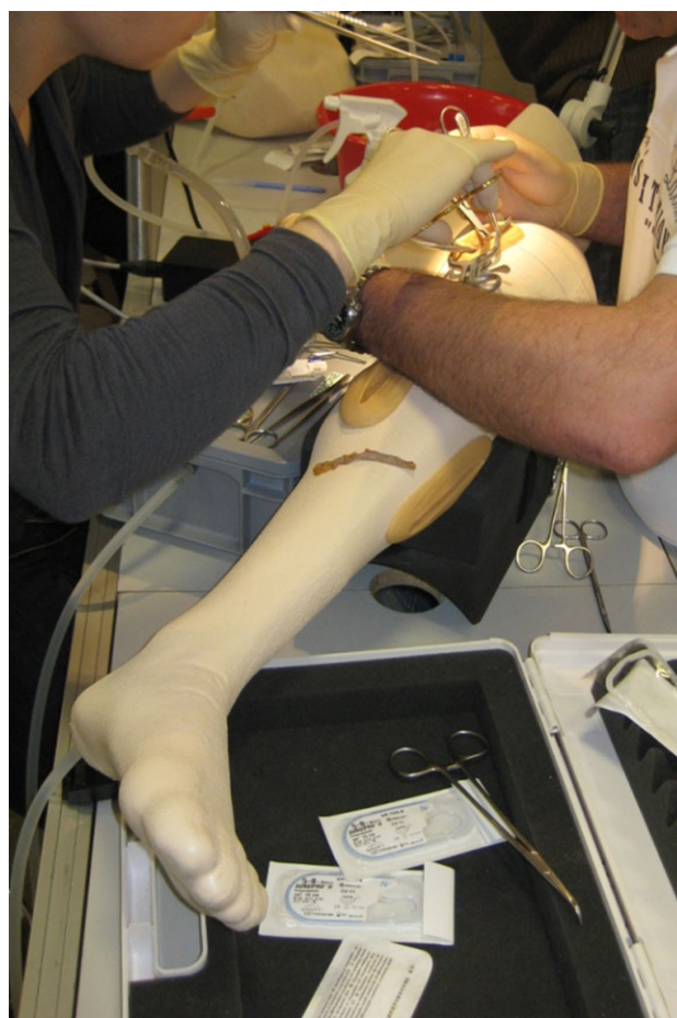
Fig. 4 Participant performing an anastomosis to the supra-genual popliteal artery using a leg model. As in all Vascular International models, the artery has a pulsatile flow