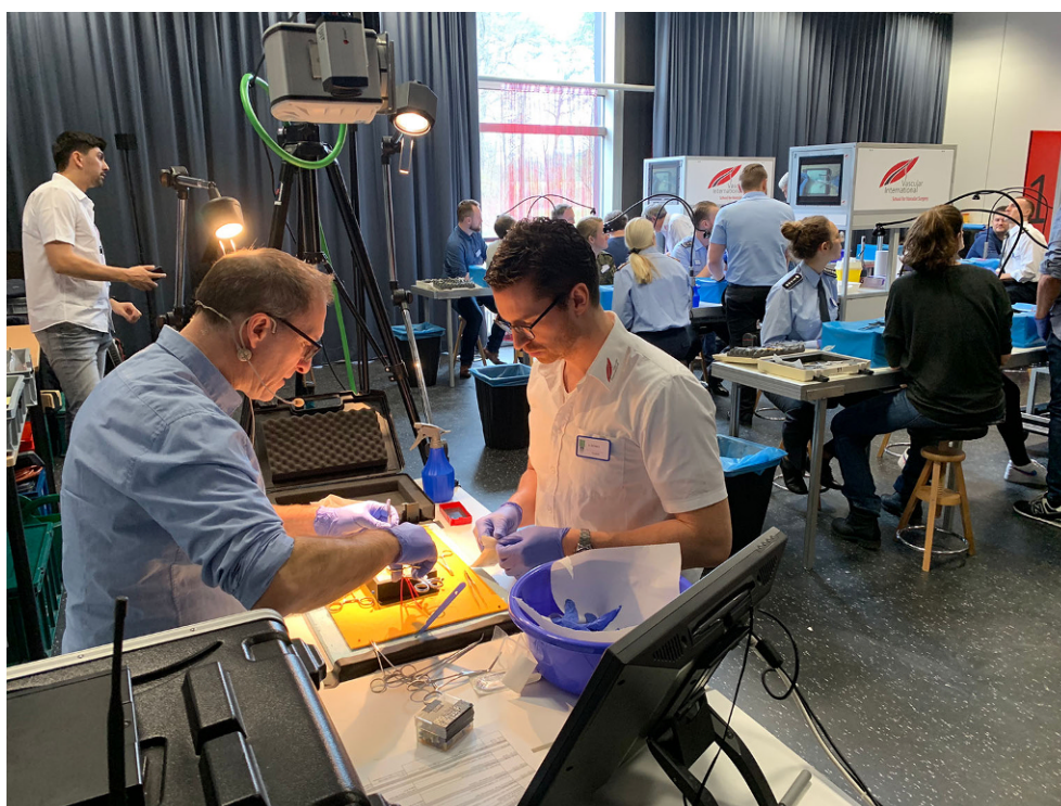
Fig. 1 Two tutors explain and demonstrate the exercise step by step while the participants watch carefully on their monitors. Thereafter, each participant repeats the exercise under supervision of the tutors

In view of these recent developments in general surgery on the one hand and the high incidence of vascular injuries in modern wars on the other, the German Army Medical Service recognized that their general surgeons required additional training in vascular trauma surgery before going on military deployment. As it was obvious that these skills could not be learned and maintained within the scope of civilian surgical practice in the military hospitals in Germany, a special vascular trauma skills training program needed to be developed. In the preceding years, trauma surgery skills courses using simulation models had emerged as an effective alternative to overcome limited open operative experience [16]. Therefore, a vascular trauma surgery course for non-vascular surgeons using established vascular surgery simulation models was developed in cooperation with the Vascular International School, Switzerland [17, 18]. Meanwhile, this course is mandatory for every German military surgeon together with concomitant courses in damage control surgery (DCS) in anaesthetized swine and a course on surgical skills for exposure in trauma using human cadavers. Together, these courses aim to fill the gap in lacking proficiency in open surgical treatment for major vascular trauma.