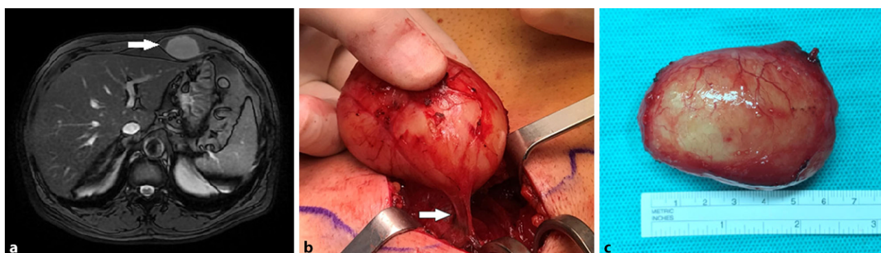
Fig. 1 Increased signal intensity of the lesion on fat-suppressed T2-weighted MRI (arrow) (a). Tumor with peripheral location of the affected nerve (arrow) (b). Resected specimen (c)

recognized entities and subtypes, were excluded [6, 7].