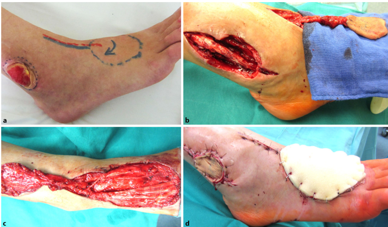
Fig. 1 Local flap reconstruction. Dorsalis pedis flap for lateral malleolus defect with exposed peroneus longus tendon. a Preoperative flap design. b Defect of the lateral malleolus with exposed peroneal muscle tendons after debridement and

dorsalis pedis flap elevation. The harvest site on the dorsum of the foot ( c ) was covered with split-thickness skin graft, which was kept in place by tie-over fixation ( d )