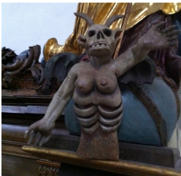
Fig. 1 Female devil sixteenth century, wood: fusion of physics and metaphysics creates a specific state of mood which mirrors the idea of the author, that today we have lost dream at the cost of knowledge. It also mirrors the seduction of man by the products of the food industry.

themselves within the postprandial hypoglycemic shock waves of their alcoholic and carbohydrate democracy. Due to the greed-driven irresponsibility of the politicians and the food industry, the Europeans are addicted to sugar and experience the stratospheric bull of the coke metabolism (Fig. 1). As a consequence, politicians are what they are: metabolic-disordered sick females and males. Europe eats itself up. Africa is waiting to come and take over. They will find food starving obese Portuguese, Italians, Greeks, Spanish, French and Croatians' French fries consumers stuck in the sand, looking like the Easter Island Moai (who the hell fixed them there?) [1], they will find stroke-rocked hobblers resembling the futuristic central, northern, western and eastern European inhabitants of the pictures of H. Bosch [2]. We have to stop eating too much, too often, and too sweet. We have to stop to tell us lies. We have to accept: nutrition needs a change; we have to inform the public, the consumers. Otherwise, we will be burned out within the fire of the profit of the