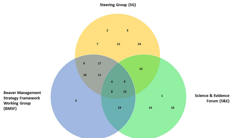
Fig. 1 Illustration of the groups upon which participants sat, using assigned participant numbers

Additionally, the second co-author sat in the groups so was excluded completely from survey design and had no input on analysis or findings (beyond opportunity provided for all participants to comment on the Findings Report). They contributed by checking study context details and reviewing structure and presentation of material. The funders had no study oversight.