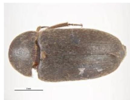
Fig. 2 Contrasts in morphology. The rarely sighted Blackburnium acutipenne has been uploaded to the Atlas of Living Australia via citizen science channels as of 30 June 2016, whereas the ubiquitous black larder beetle ( Dermester ater ) has not. a Scarab beetle ( Blackburnium acutipenne ). By Mark Golding https://images.ala.org.au

image/view/136812726 . Licensed CC BYNC4.0 https://creativecommons.org/licenses/by-nc/4.0/ . b The black larder beetle ( Dermester ater ). By Simon Hinkley & Ken Walker, Museum Victoria http://www.padil.gov.au/pests-and-diseases/pest/main/135708 . Licensed CC BY 3.0 AU https://creativecommons.org/licenses/by/3.0/au/