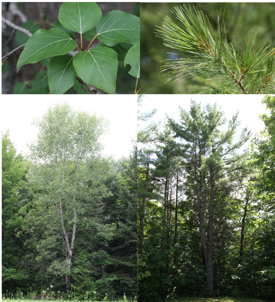
Fig. 1 Balsam poplar leaves (upper left) and white pine branch tip with pine needles (upper right). A specimen of balsam poplar (lower left) and white pine (lower right). in Cantley, Canada (white pine tree, 22 d July 2021). Balsam poplar full plant and leaves, 25 th July 2021 and Wakefield, Canada (white pine needles, 22 d July 2021). Note how high the white pine grows, emerging from the forest canopy. Besides its impressive stature, this coniferous species is evergreen, while balsam poplar is deciduous

In this section, we aim at furnishing more details on two representative trees originating from North America mentioned in the previous section. Of these, the balsam poplar ( Populus balsamifera ) is a hardy, fast-growing deciduous tree (Fig. 1, left) which is known for the intense fragrance emanating from its resinous buds which have long been an important source of medicine for the indigenous Cree Nations of Eastern James Bay in Canada. It is used specifically as a remedy against obesity and diabetes; therapeutic properties which have also been demonstrated through scientific studies (Ouellet et al. 2016). Among the biogenic VOCs emitted by the balsam poplar, there are isoprene and terpenes like