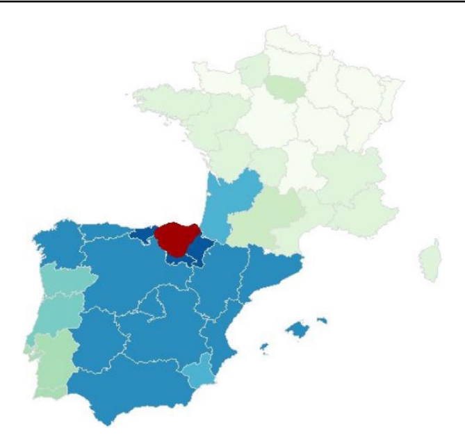
Fig. 3 Basque Country's social ties. Note: The figure depicts a heatmap of Basque Country's social ties. The colors highlight the connections to the focal country, which are given in red. The lightest color corresponds to the 10th percentile of social ties between region-pairs globally; darker colors correspond to closer connections.

countries' nominal exchange rates. Based on the bilateral exchange rate, we then constructed an index that took the value of 100 in the base year of 2015. Fifth, we obtained the stock of international migrants for 2010 from the United Nations Department of Economic and Social Affairs Population division. Because the value of the stock of domestic migrants was not available for most countries, we employed the World Bank's Development Indicator data for each country's population in 2010. From each country's total population we then subtracted the number of migrants.