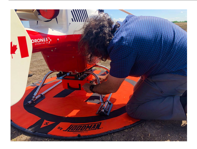
Fig. 3 Location of the RPAS Delivered Remotely TeleMentored Self-Diagnostic Ultrasound System under the SDO-50V2 multi-purpose single-engine unmanned helicopter

The specific focus of this evaluation was on lung ultrasound, whose application has exploded in the last decade in trauma resuscitation, managing critical cardiopulmonary diseases [12]. In particular in recent months, lung ultrasound has utility for diagnosing, stratifying, and following the course of pulmonary therapies in COVID-19 [11, 13, 14], including potentially diagnosing asymptomatic patients, or those with false negative or delayed PCR testing [15]. However, with POCUS being a non-invasive means of assessing anatomy, physiology, it enables just-in-time first responders to better recognize the need for and deliver directed lifesaving interventions leading to increasing inclusion across the entire field of medicine [16], especially those challenged