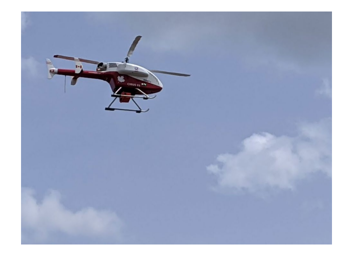
Fig. 2 SDO-50V2 multi-purpose single-engine unmanned Helicopter system equipped with the RPAS Delivered Remotely TeleMentored Self-Diagnostic Ultrasound System in flight

and communicating over ZOOM (Zoom Video, San Jose, CA). Following informed consent (University of Calgary REB14-0634), the mentor guided the subject to conduct a remotely mentored lung examination on himself (Fig. 4 and Supplemental File 4), successfully examining all the anatomic areas of the Extended FAST [9] and Bedside Lung Ultrasound in Emergency protocols [10], and in addition all the anterior, lateral, and inferior posterior lung bases, recommended for use with patients suspected or diagnosed of Coronavirus Disease 2019 (COVID-19) [11]. It is emphasized that the examination was fully guided by the mentor, who was responsible for any and all interpretation of the images.