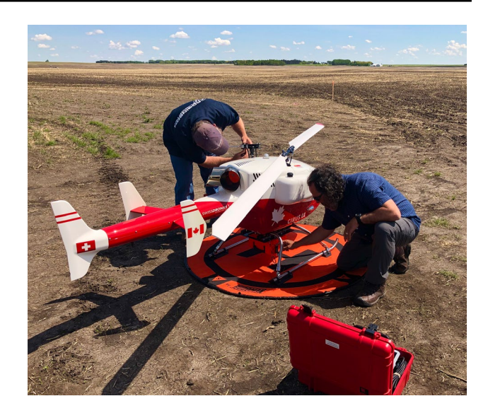
Fig. 1 SDO-50V2 multi-purpose single-engine unmanned Helicopter system equipped with the RPSA Delivered Remotely TeleMentored Self-Diagnostic Ultrasound System being prepped for take-off

The entire system was sanitized (Supplemental File 1) and packaged for transport aboard the SwissDrones SDO50 V2 VTOL multi-purpose single-engine unmanned Helicopter system (Swissdrones, Buchs, Switzerland) with a payload capacity of 43 kg and endurance in excess of 3 h flight-time (Figs. 1 and 2). A flight occurred near Olds, Alberta and landed near the completely ultrasound-naïve volunteer (Supplemental File 2). The volunteer recovered and unpacked the contents of the RPAS-RTSDUS (Fig. 3 and Supplemental File 3) under the direction of the remote mentor located in Foothills Hospital, Calgary, who viewed