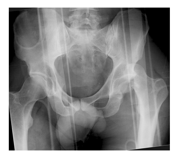
Fig. 1 Anteroposterior (AP) pelvis radiograph of a 36-year-old male involved in a motor vehicle collision with a left femoral head fracture dislocation

(Fig. 1). The infrequency of these fractures has made the study of large patient populations difficult; multiple small studies constitute the majority of the available literature on this topic. A recent systematic literature review of this heterogeneous literature was performed, and included 29 articles describing a total of 453 total fractures; definitive management data was available for only 425 fractures; 99 fractures were managed non-operatively and 326 were treated with surgery [1].