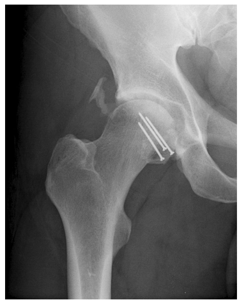
Fig. 5 AP radiograph of a 37-year-old patient 15 months after ORIF of a femoral head fracture with non-bridging Brooker I heterotopic ossification

The anterior Smith–Petersen approach was utilized to address the majority of these injuries. This approach provides excellent visualization of most fractures, allows anterior femoral head dislocation, and does not disrupt the posterior based blood supply to the proximal femur. The Smith-Petersen approach has been associated with increased rates of HO [11]. Our series found that 40.6% of