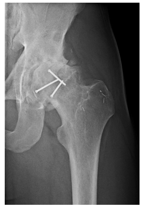
Fig. 4 Follow-up radiograph of a 19-year-old male 4 years after left femoral head operative reduction and internal fixation (ORIF) with end stage post-traumatic arthritis in the hip joint

The anterior Smith–Petersen approach was utilized to address the majority of these injuries. This approach provides excellent visualization of most fractures, allows anterior femoral head dislocation, and does not disrupt the posterior based blood supply to the proximal femur. The Smith-Petersen approach has been associated with increased rates of HO [11]. Our series found that 40.6% of