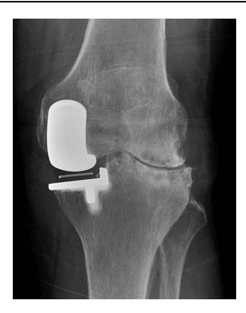
Fig. 7 Lateral OA progression after medial UKA