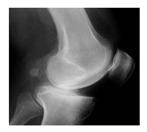
Fig. 1 Lateral X-ray showing posterior wear of the tibial plateau in an anterior cruciate ligament (ACL)-deficient knee

These are the key reasons for UKA to be a preferred and appealing treatment option for either young and/or active