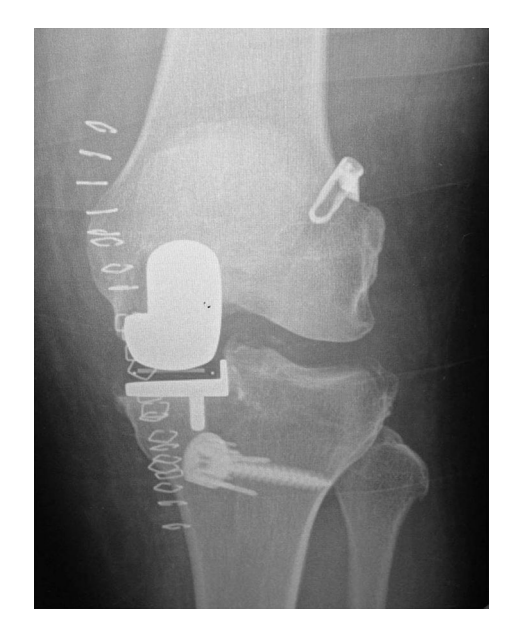
Fig. 4 Post-operative X-ray of a combined unicompartmental knee arthroplasty (UKA) and ACL-reconstruction

ACL reconstruction can be performed simultaneously or in a staged procedure. Combined UKA and ACL reconstruction (Fig. 4) becomes a longer and more technical