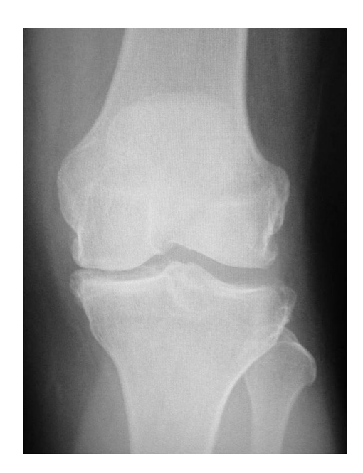
Fig. 2 End-stage medial compartment osteoarthritis (MOA)

In the subjective evaluation of these patients, mechanical pain is usually present due to the MOA, eventually associated with a swollen knee. On the other hand, instability, even if ACL is deficient, may not be referred as a main symptom, probably because of the muscular status,