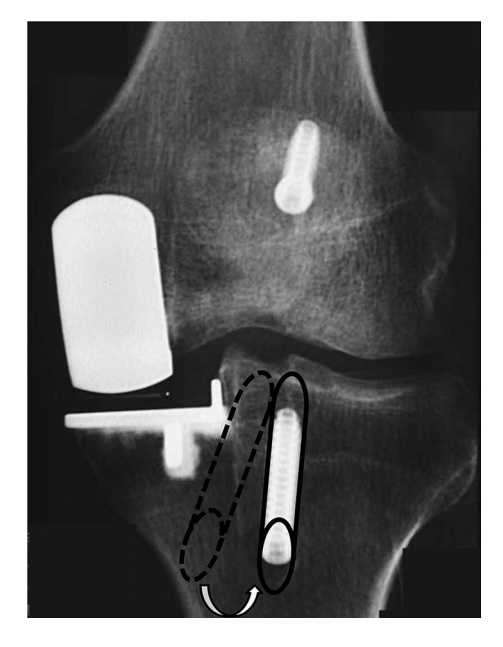
Fig. 5 Lateralised and verticalised tibial tunnel in combined UKA and ACL-reconstruction

The surgical technique has been described by different authors [6, 21, 31, 33]. One key technical aspect is to avoid impingement of the graft tunnel on the tibial component of the UKA [15], and a second key aspect is to tension the graft properly. In addition, it is also possible that one may weaken the tibial plateau, leading to an additional risk of tibial fracture. Therefore, the advice is to perform the tibial tunnel slightly more laterally than usual [31] and/or in a more vertical direction to reduce the medial stress/ impingement (Fig. 5). If cementless implants are used, the