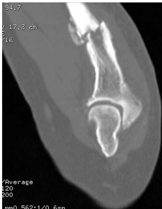
Fig. 3 Computed tomography (CT) scan of the left forearm; Sagittal reformat shows the transverse fracture through the proximal ulnar metaphysis with associated callous formation

fractures if the clinical history is not clear or when such fractures occur in the setting of an underlying primary malignancy elsewhere.