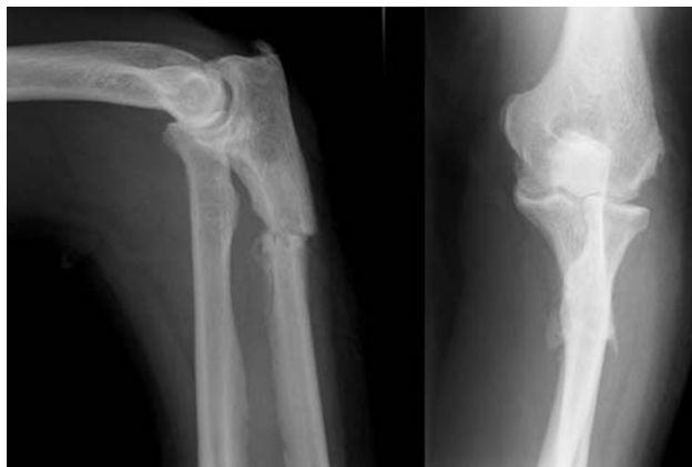
Fig. 1 Anterior-posterior (AP) and lateral plain radiographs demonstrate a transverse fracture through the proximal metaphysis of the ulna

A repeat plain radiograph at 5 weeks showed signs of fracture union. However, in view of the unusual site of the fracture, a magnetic resonance imaging (MRI) scan was requested. MRI was performed on a 1.5 tesla Siemens scanner using a body coil as the patient's body habitus did not permit the use of a surface coil available in our institution. The quality of the resulting scan was therefore slightly suboptimal. MRI showed features of a healing stress fracture in the proximal ulna. In addition, there was bone marrow oedema in the proximal radius without a definite fracture line—appearances consistent with a stress reaction (Fig. 2a–c). There was no evidence of neoplasm or infection. A subsequent computed tomography (CT) scan showed no fracture line in the radius and no signs of underlying bone pathology in either of the bones (Fig. 3). The patient reported improvement in symptoms upon clinical review. We have received written consent from the patient for publication of this article.