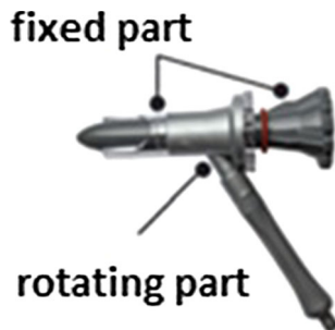
Fig. 1 HemorPex System © ANGIOLOGICA B.M. S.r.l., Pavia, Italy. Available at: http://www.hemorpexsystem.it/index.php?lang=1&id=home

Eighty-eight patients had grade II (76 %), 21 grade III (18 %) and 7 grade IV (6 %) hemorrhoidal disease; 6 of these patients had recurrent hemorrhoids after having undergone prior surgical treatment, while 6 had an associated local pathology such as anal fissures or anal polyps that we treated at the time of surgery for the prolapse. For all patients, we recorded pain levels after surgery by means of the visual analog scale (VAS), obtaining a mean VAS