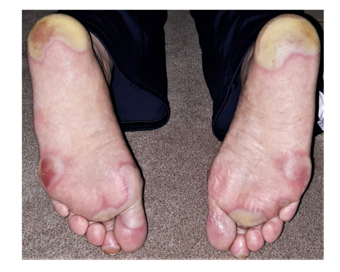
Fig. 1 Severe hand-foot skin reaction (HFSR) in a patient with glioblastoma treated with regorafenib, leading to impaired activities of daily livings

During the study period, 5 patients passed away. Overall survival (OS) for the entire cohort for treatment with